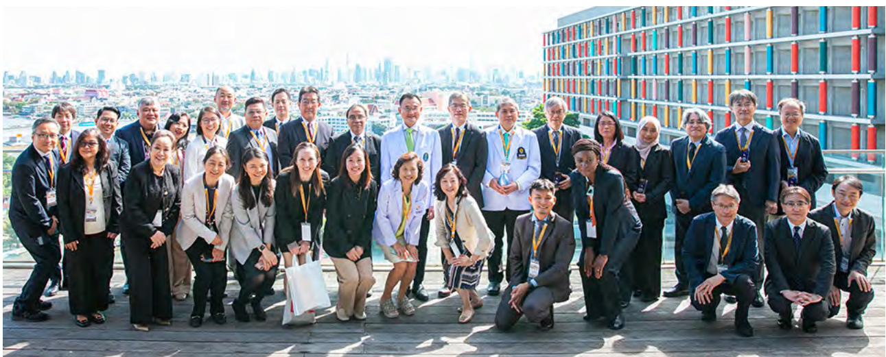
Participants attending the 3 rd ARISE Annual Meeting in Bangkok, Thailand.