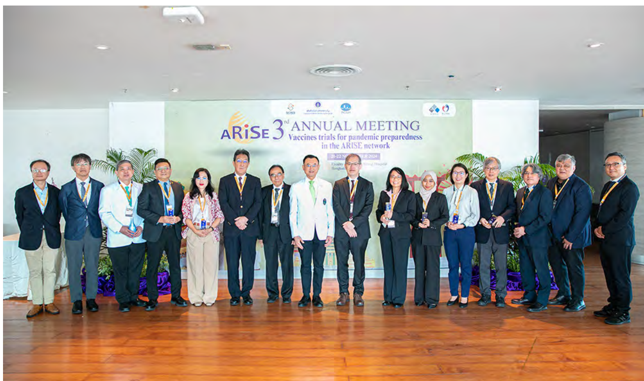
Steering Committee members gathered for the 3 rd ARISE Annual Meeting in Bangkok, Thailand.

The Steering Committee members meet in person once a year to discuss important issues and determine the direction of the network.